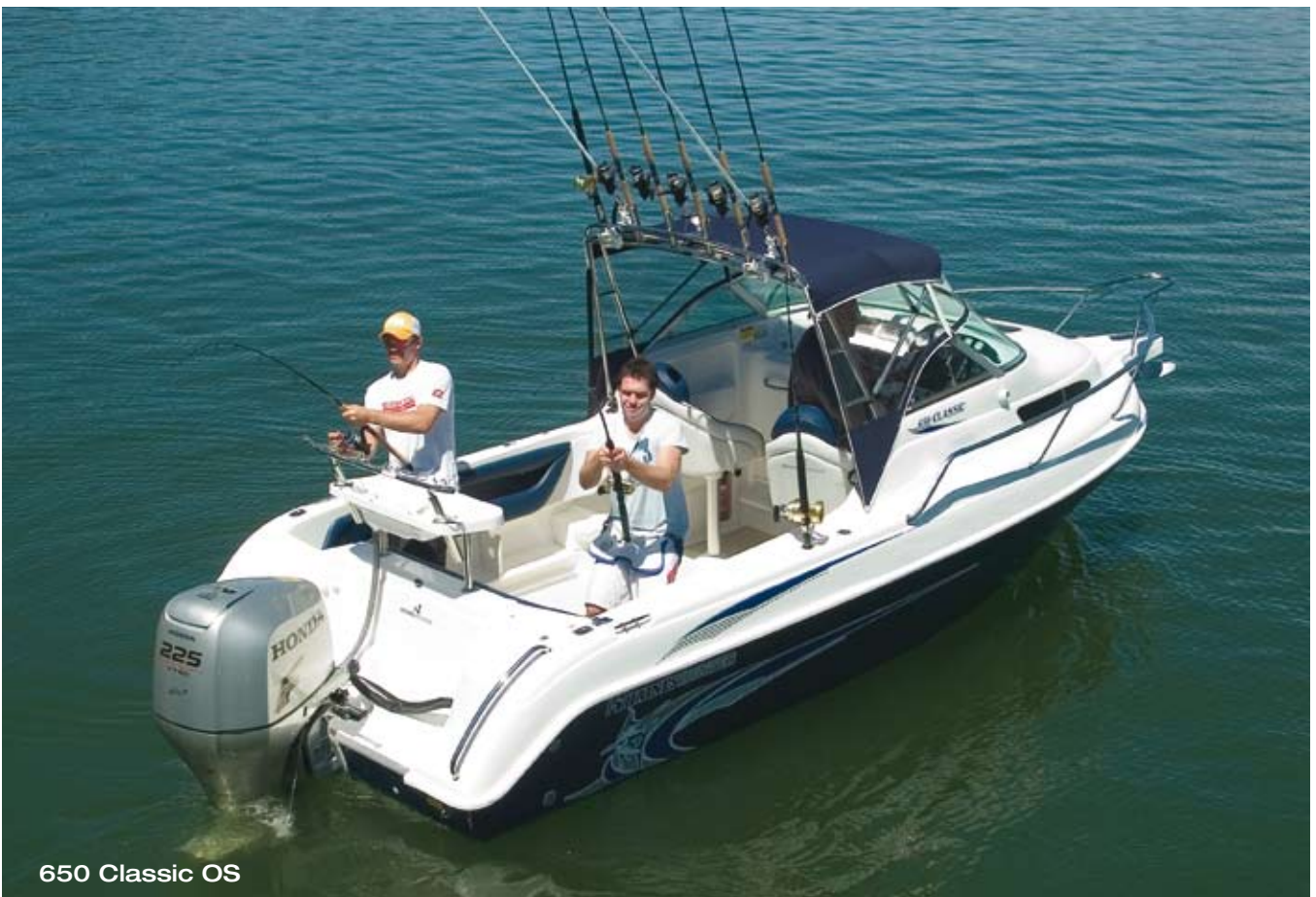
650 Classic OS

The boat's heavy hull ensures a superior ride and every inch of this boat has been designed to take advantage of the available space. You'll even comfortably sleep two adults on board.