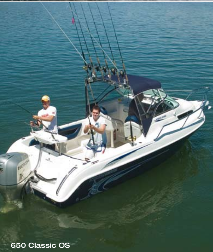
650 Classic OS