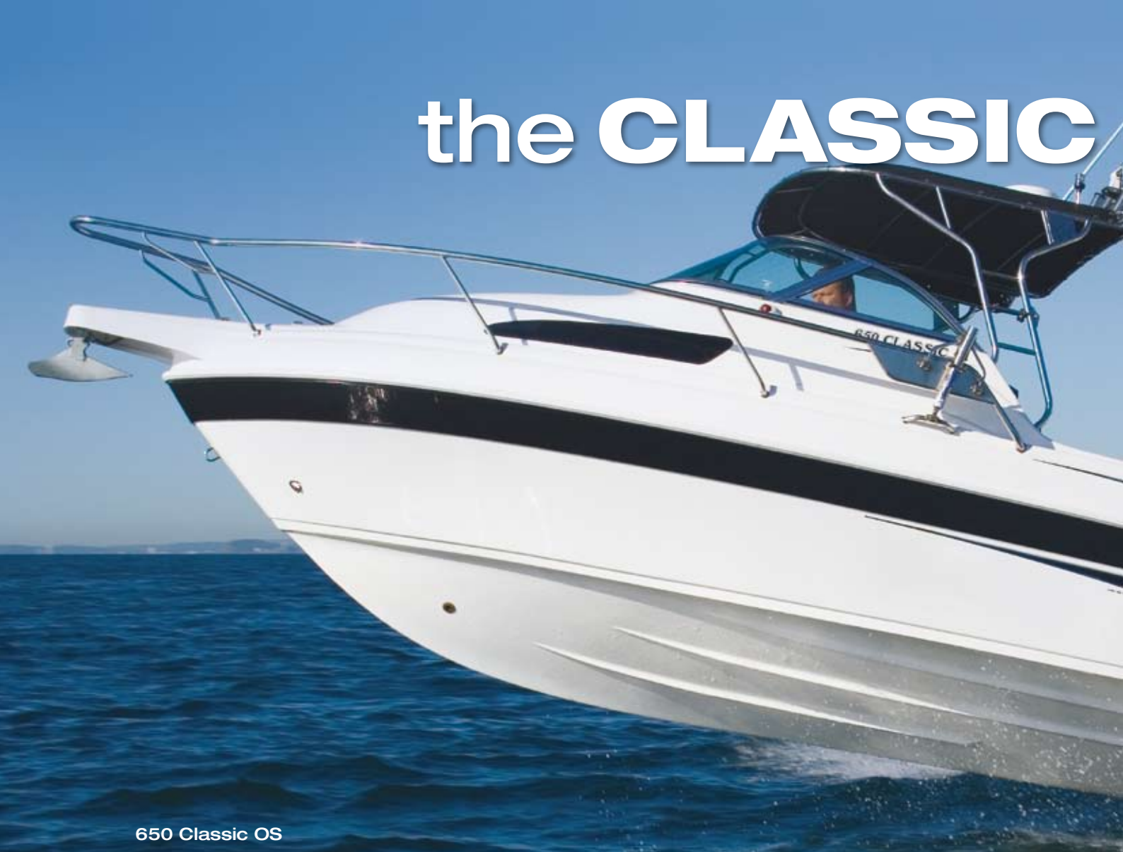
650 Classic OS