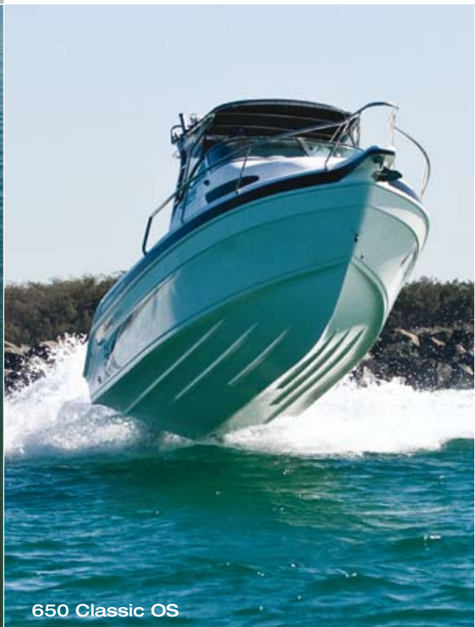
650 Classic OS