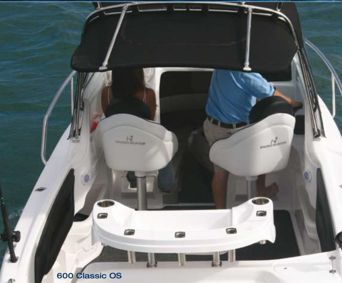
600 Classic OS

The perfect combination of family boating and fishing fun, the Classic Offshore series offers you all your basic fishing requirements with a few more of the little luxuries you have come to expect from Haines Hunter. Even Mum will be impressed with the long list of creature comforts available on this fishing boat.